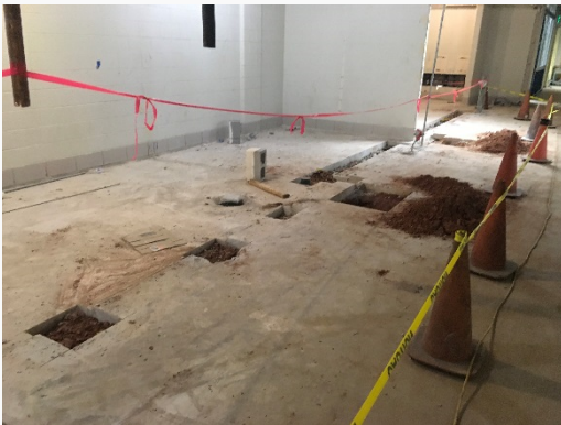
Sawcut Slabs to Install Plumbing