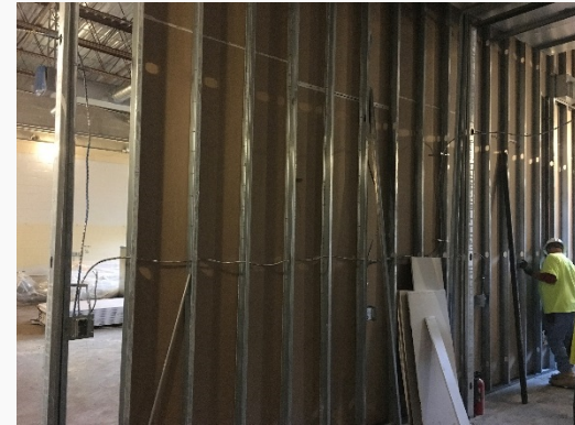
Drywall/Framing & MEP Rough