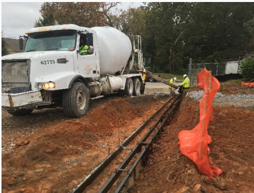
Installation of Curb and Gutter