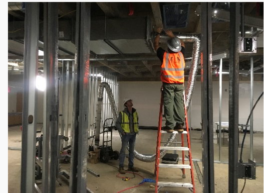
Renovation Framing and MEP Rough