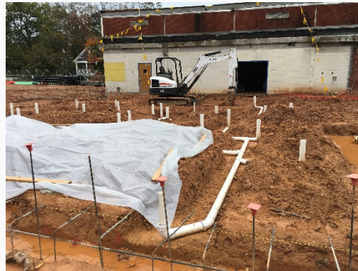
Underground Plumbing Rough