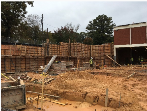
Complete Retaining Wall Formwork